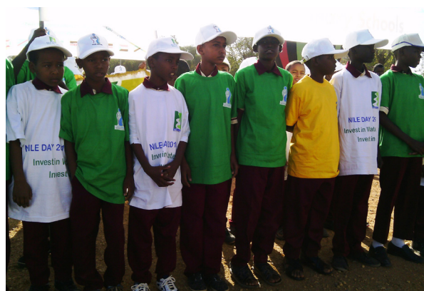
Children joined celebrations of the Nile Day 2015