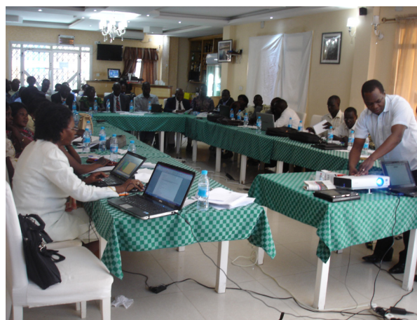
Stakeholder Mapping Participants in South Sudan

During the stakeholder mapping in all the three countries, key issues considered were: membership and geographical coverage or the eco-mapping, participation