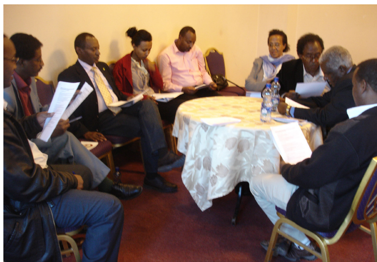
Focus Group discussion during Stakeholder Mapping in Ethiopia