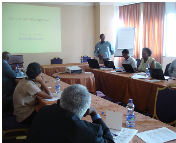
Capacity Building, Ethiopia

the CRM and DRR/M. This happened in tandem with the stakeholder mapping workshop that took place in each of the countries on days scattered in the months of February and March 2015.