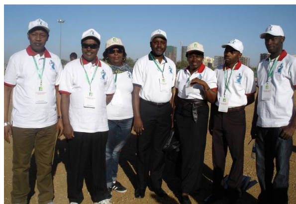
NBD Team during the Nile Day 2015 celebrations in Khartoum, Sudan