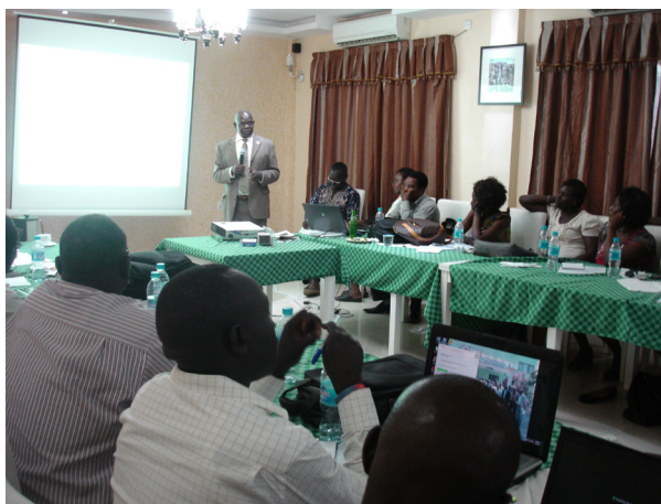
Capacity Building, South Sudan